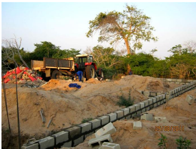
Photo 1. School, 25 August 2011