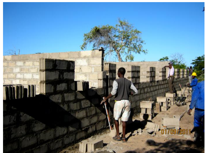
Photo 2. School, 1 September 2011